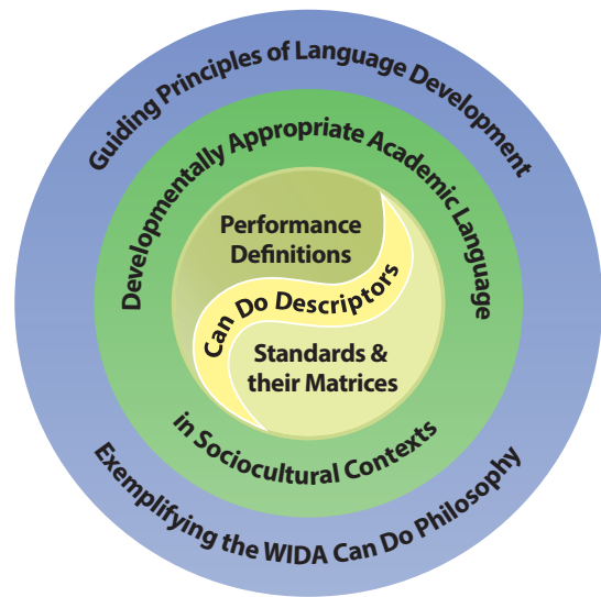
Figure A: WIDA Standards Framework

The components of the WIDA Standards Framework interact and influence each other in the design of curricula, language instruction, and assessment of language learners. Teachers and school leaders are encouraged to highlight specific components of the framework in their language education programs to fit the specific needs of individual students and contexts. In doing so, all stakeholders can participate in shaping the education of our increasingly rich and diverse student population.